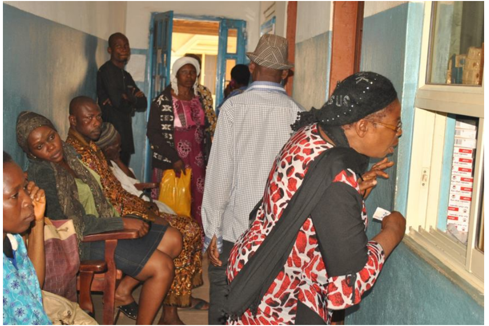
Fig. 3. Patients waiting to collect their medications