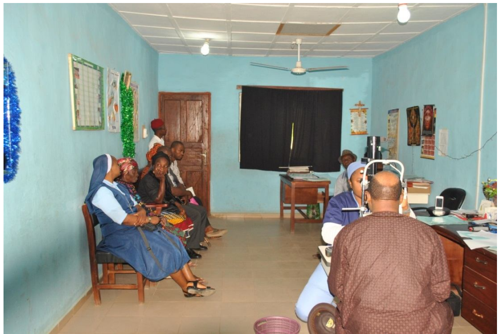
Fig. 4. 1 st consulting room