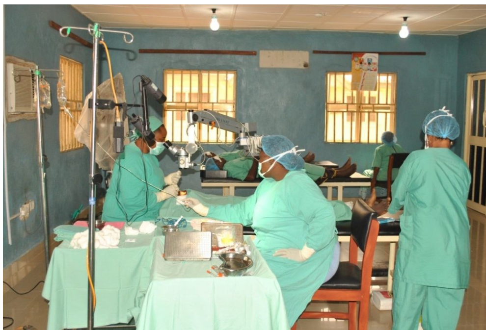
Fig. 5. Theatre section