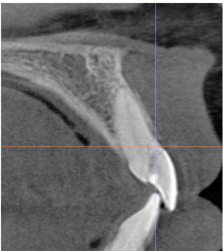
Fig. 7. Case 2. CBCT scan. Different cross-section exposing tooth 11 root canal patency.