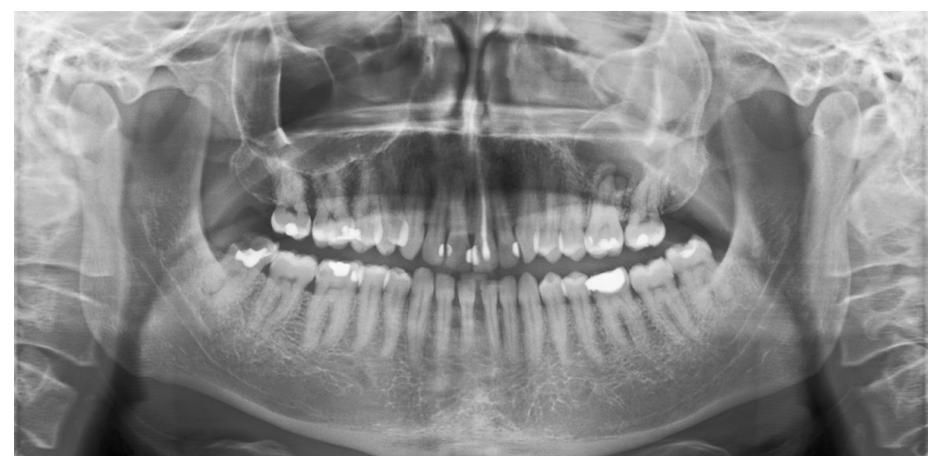
Fig. 1. Case 1. OPG revealing radiolucency surrounding roots of tooth 26 and possible lesion located in the left maxillary sinus.

As a first step of treatment, canals of tooth 26 were prepared using Mtwo mechanical files. Due to difficult access and reached potency of palatal root, broken instruments were left in place. Canals were temporarily filed with calcium hydroxide paste, that was repeatedly replaced for three months. After visible signs of healing of the periapical lesion stared to be seen, root canals were obturated and the tooth was restored with composite cement. During follow-up at six months, the tooth demonstrated proper healing of periapical tissues (Fig. 4). The patient reported no pain or discomfort regarding tooth 26.