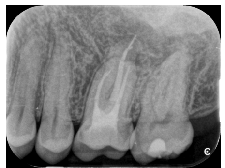
Fig. 4. Case 1. Dental periapical X-ray. Six months follow-up showing proper healing of periapical tissues of the tooth 26.