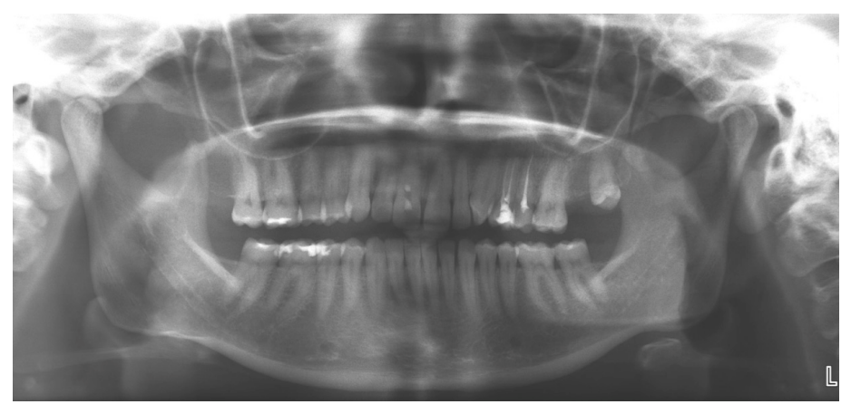
Fig. 5. Case 2. OPG. No visible canal of tooth 11.

Resin-modified flowable glass-ionomer cement (Geristore) and MTA cement were used to seal a perforation and root canal treatment was performed (Fig. 8). Follow-up at three months showed proper healing.