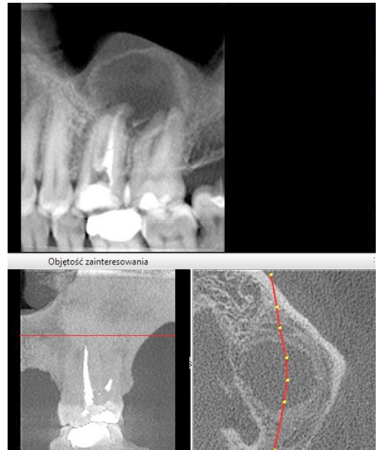
Fig. 3. Case 1. CBCT scan showing a large, well demarcated, oval radiolucency surrounding half of palatal root of tooth 26.