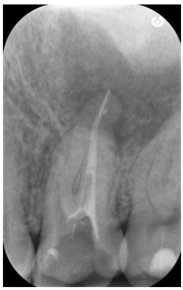
Fig. 2. Case 1. Periapical X-ray revealing a large periapical lesion of tooth 26 and a separated instrument in the palatal canal.