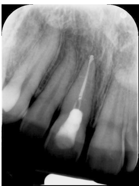
Fig. 8. Case 2. Periapical X-ray. Tooth 11 after perforation management and root canal treatment.